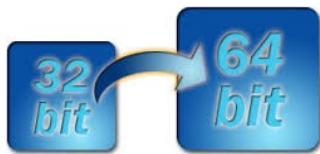
RasterCAD RasterCAD PLUS

12 Months of Product Upgrades + Telephone Support for FREE